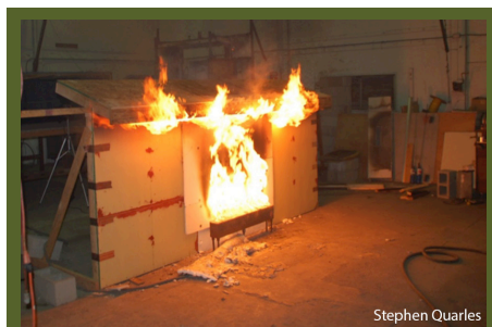
Flame impingement exposure to the underside of the eave, and time-to-ignition of the joists, blocking and fascia was quicker; and lateral flame spread faster, when an open-eave design was used in research experiments.