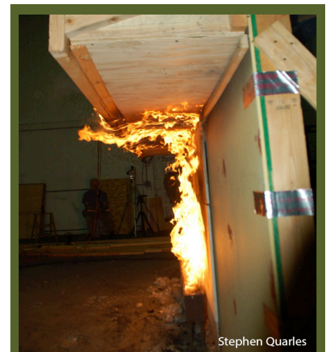
Lateral flame spread was reduced when a combustibile soffit material ignited in this test of a soffited-eave with a combustibile soffit material.