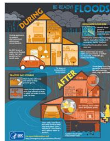
Infographic: Be Ready - Floods